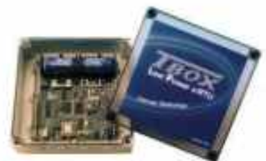
Compact and low power versions